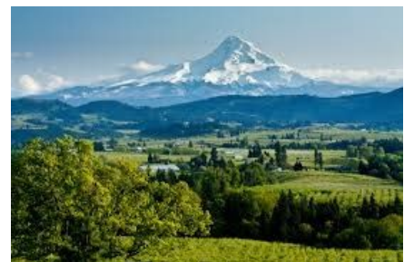
Oregon Wine Country